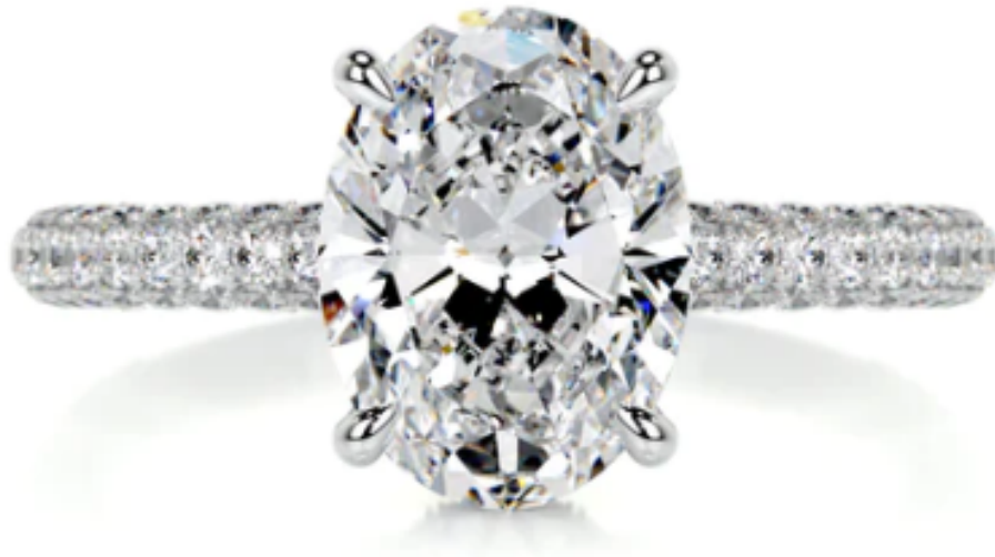
A Moissanite and Diamond Ring

Meet Rebecca, a stunning moissanite and diamond ring that needs no occasion in order to shine. This beauty mixes moissanite and diamonds in such an astounding way, that you simply can't take your eyes off of it and its 3.5 carat 14k white gold figure. If you're worried about the price, well, we can tell you that from a quick scan of the <Brand Name> website, it is now sold for only $2,615, with the holiday sales and all. And this is just one example. Think of the endless possible ways that you can say "I love you" even if it's not a special day, with such a stunning rock.