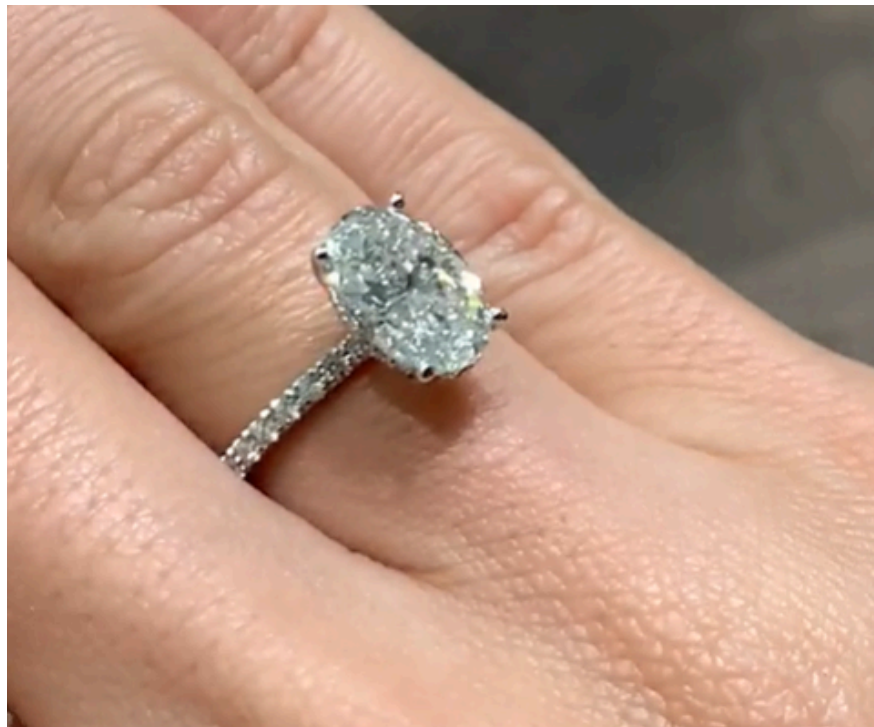
A Lab Grown Diamond Ring

Take, for example, the collection of lab grown diamond rings offered at the famous online store of <Brand Name>. You've got a selection of thousands of different amazing rings, in all shapes, sizes, styles, colors and price tags. And that's just one example. Shop around and compare. You'll see exactly how popular these rings have become.